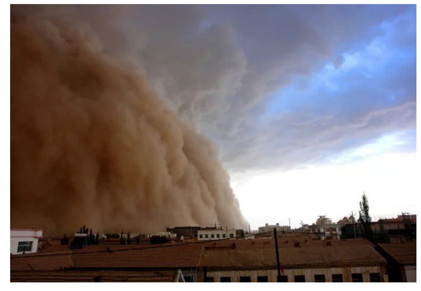
Sandstorms, like this one in Inner Mongolia, regularly blow across the border into China. But the main factor causing them might have less to do with Mongolia's environment and more to do with wind speeds.

When strong dust storms have swept across China, the people and the government have often pointed the finger at neighbouring <u>Mongolia</u>, accusing it of not protecting its grasslands.